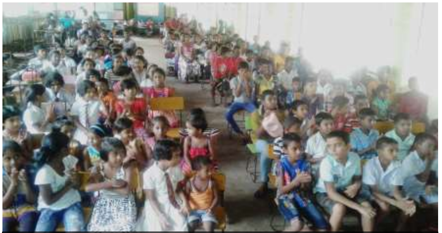
Scholarship Holders at Thunthalawa

This is a remote village which had been developed in stages with the funds provided by Adoptie Sri Lanka Belgium VZW. Some of the projects funded by Adoptie Sri Lanka Belgium VZW upto now from the start are the two drinking water supply schemes to the village, a