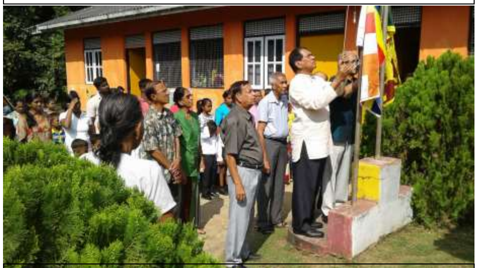
Hoisting Flags at Vanameekanda