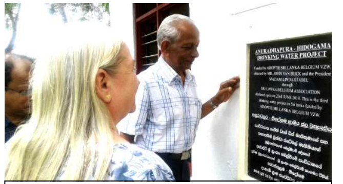
Declare open the plaque at Hidogama Water purification project