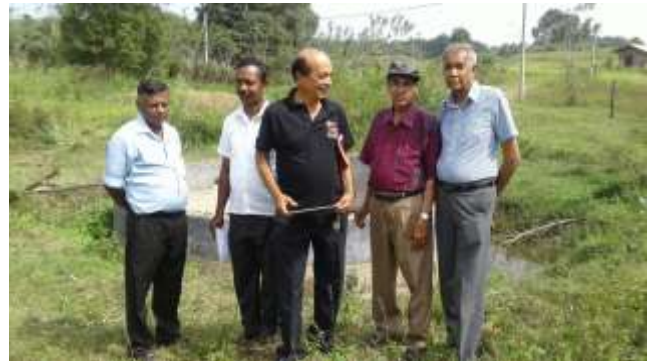
Site inspection at Kajuwaththa on 13.02.2018