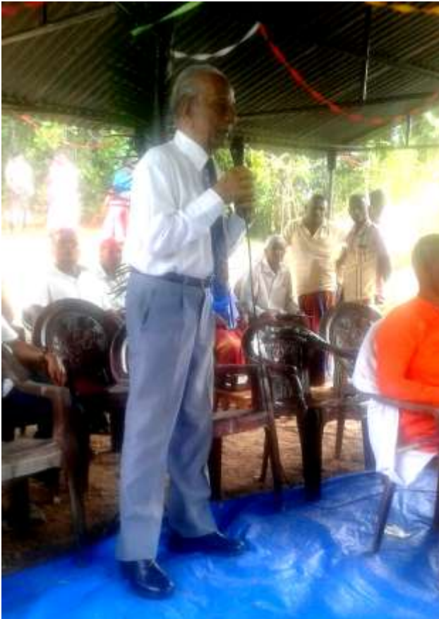
Address by SLBA President at Nawamahasenpura