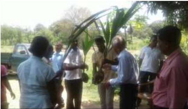
Distribution of Coconut Plants at Kajuwaththa