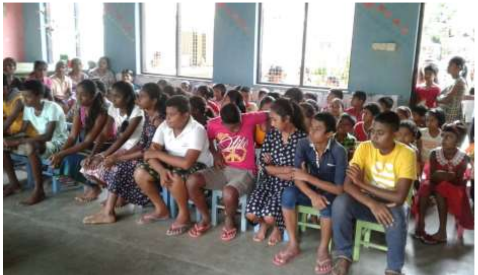
Scholarship Holders at Vanameekanda

The activities that the SLBA started under this project are continuing. "Dilena Tharu" pre-school which was started on 30th December 2001 admitted the first batch of students in 2002 and is progressing with additional facilities. This pre-school with 42 students is presently managed by two lady instructors. Admission procedure followed at the pre-school is that three year old children from the village and the adjoining villages qualify to gain admission and leave the school on reaching the five year age. In the year 2017 this pre-school had 39 children.